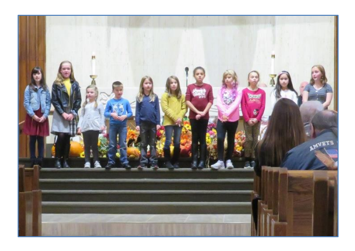
The Community Ecumenical Pre-Thanksgiving Service was hosted by St. Joseph Roman Catholic Church this year on Tuesday, November 26, 2019.