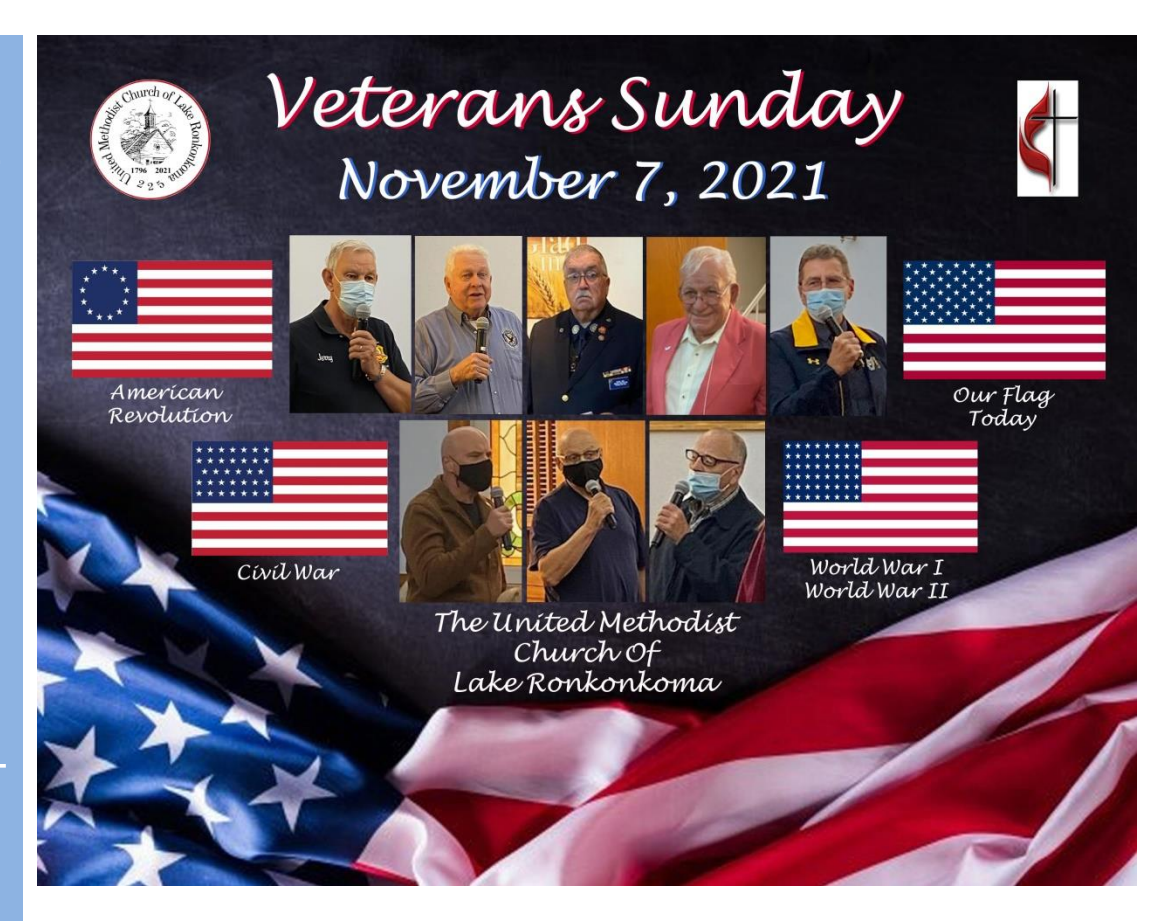
God Bless our Veterans

We are the church at Five Corners spreading the "Light of Christ" from ourselves to the community and the world.