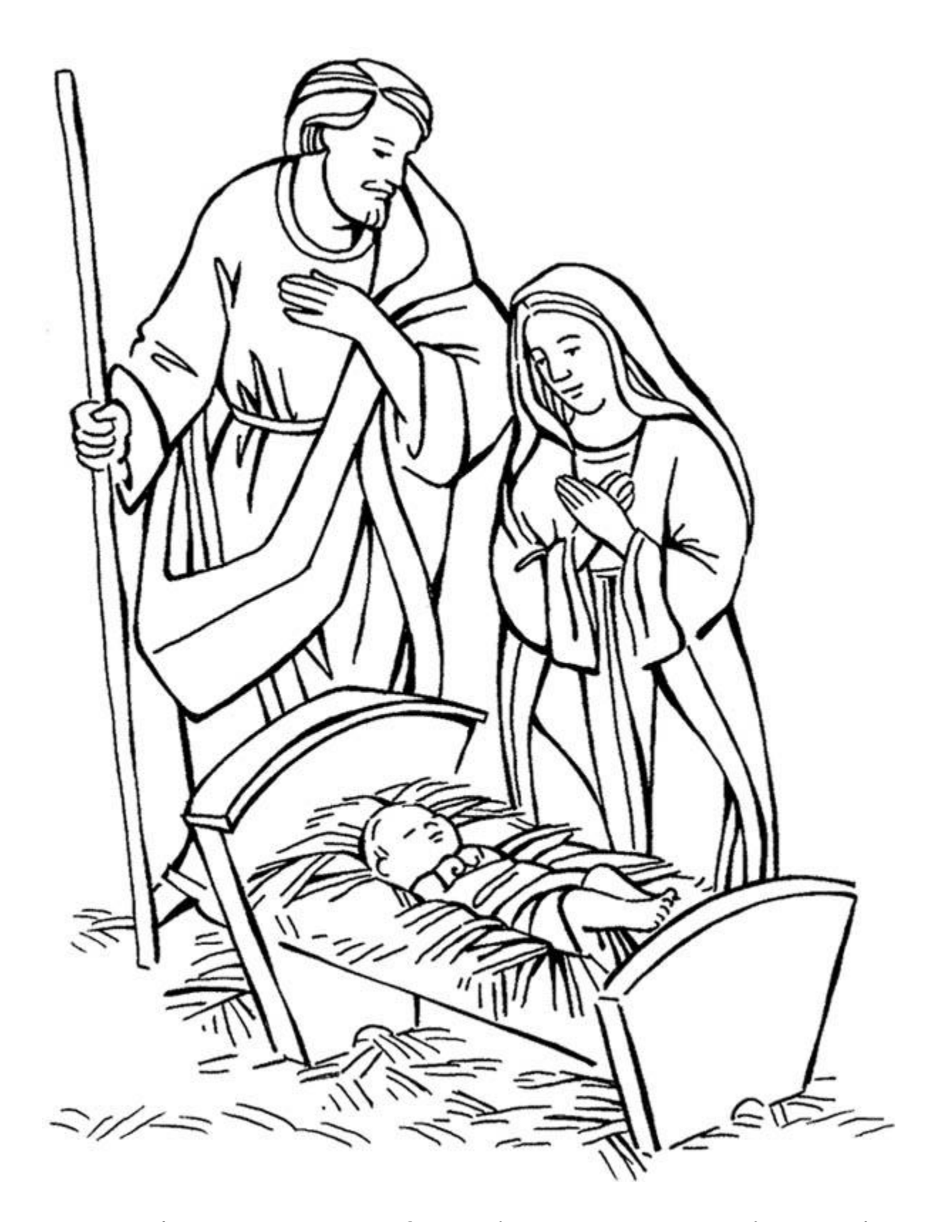
A coloring page for the young at heart!