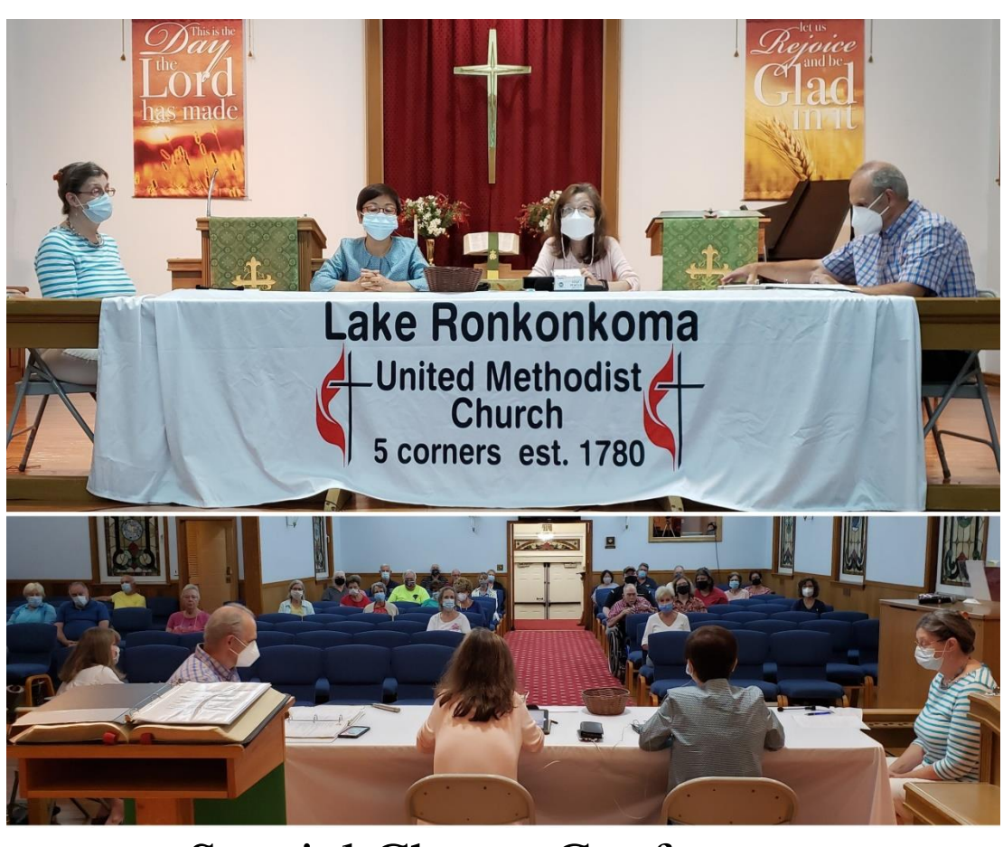
Special Charge Conference