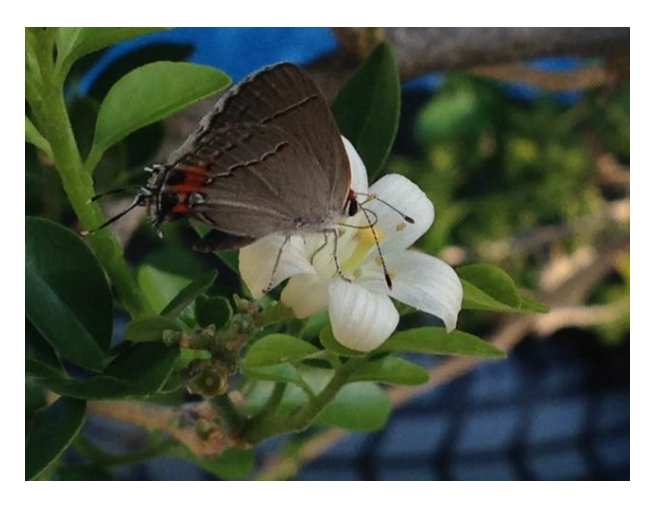
BEAUTY IS ALL AROUND US!