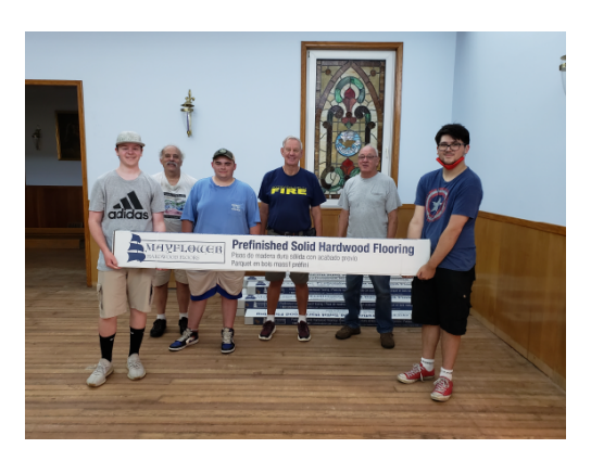
The Floor Crew