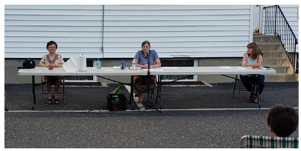
07/14/20 Church Council meeting with social distancing observed