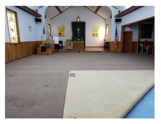
Taking up the old carpet