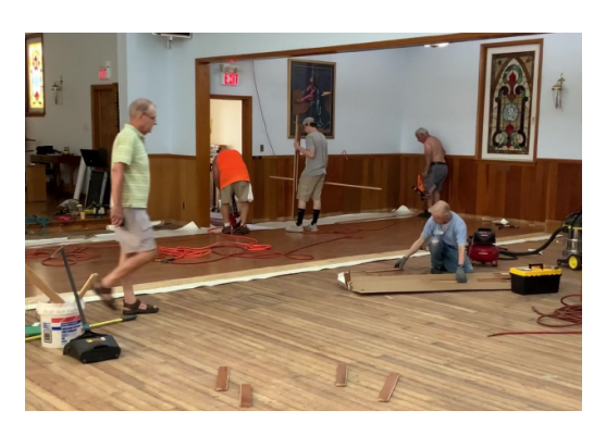
Hard at work