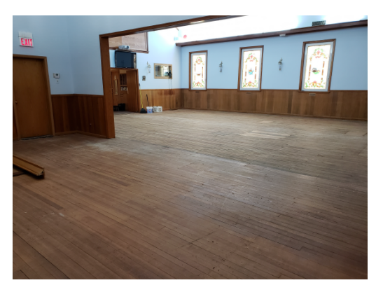
Original 1906 floor under carpet