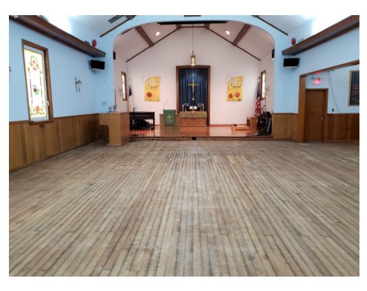
Original 1906 floor under carpet